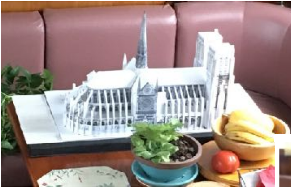
Below to the left is the South side of Notre Dame with the two (2) small outbuildings, the bridge and part of the