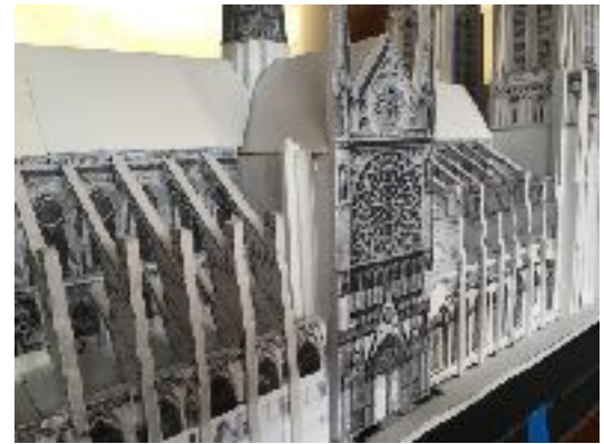
Left shows entire model on table for size comparison.

In preparation of this endeavor each year we collect photographs, maps and other information on our subject building. We also determine how we will construct it as everything must be eatable according to the international Gingerbread Building Completion rules. With the more complex buildings we build a model to confirm our proposed construction methods. We will start the baking in a few weeks, however since there is a limitation in space in our monthly newsletter we thought we would share the photographs of the model with you this month so that next month our newsletter can commit more space to photographs of the finished gingerbread Notre Dame.