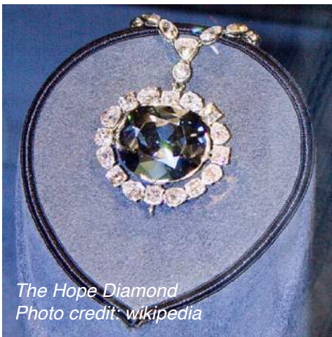
The Hope Diamond

The author Michael Crichton has been quoted saying...“If you don't know history, then you don't know anything. You are a leaf that doesn't know it is part of a tree.” History is important. It matters not if it is your family history, your community's history, your country's history or the world's history. Most of us have recognized the importance of preserving some of our historic buildings. They help anchor a community and give us pause as to who we are, and how we arrived at where we are, and what things that have been important to us as a community.